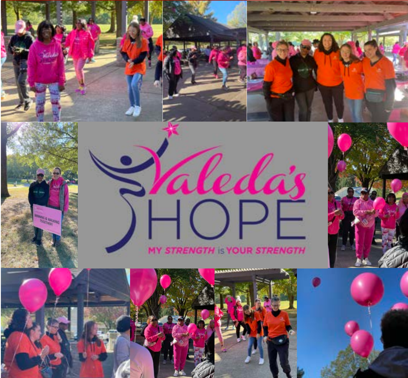
Oct. 8th - Valeda's Hope - Walk To Winn - Increasing Breast Cancer Awareness