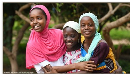
Ending Child Marriage