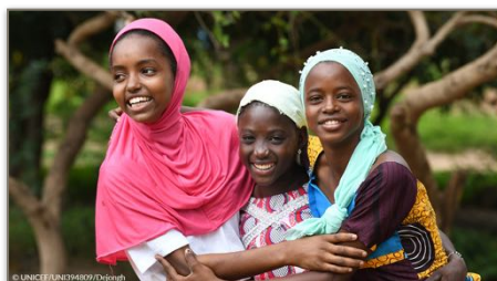
Ending Child Marriage